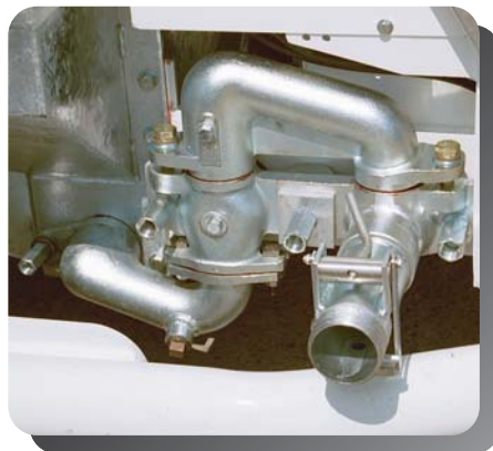
3 inch outlet shown

High volume cast steel manifold assembly with 2 or 3 inch outlet. Solid Tungsten Carbide seats for maximum life and a pressure relief valve for added safety.